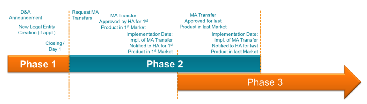
Figure 1: D&A phases derived from the activities regarding the transfer of the marketing authorizations from Transferor to Acquirer

Phase 1 starts with the announcement of the D&A activity by the Transferor and/or the Acquirer and includes the so-called Day 1. During that phase, the Transferor might establish a new legal entity in order to carve out the business that is divested to the Acquirer. Prior to Day 1, the Transferor might at first transfer his marketing authorizations to this new or to an already existing legal entity within his corporation that is subsequently transferred to the Acquirer.